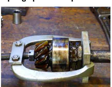
Bearing removal tool.