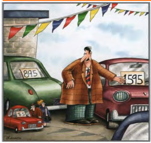
"Hey, hey, hey! Are you folks nuts? I'm Telling you, this is the car for you."