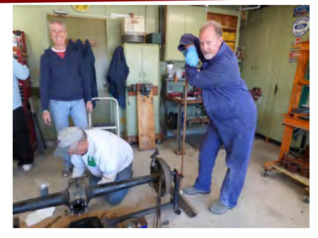
Practicing to work at Caltrans.