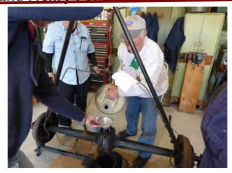
Pouring thinner in to remove sludge and debris.