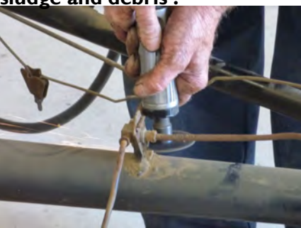
Hyd. Brake lines needed removing.